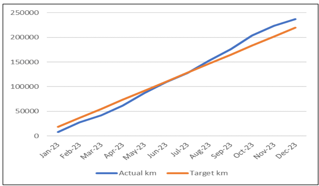
Table 2: Electric bus mileage

Additionally, Table 3 shows that the E-Buses are comparable to the average mileage of our diesel fleets. This table shows that the transition to an electric-bus fleet should not have an impact on service capacity.